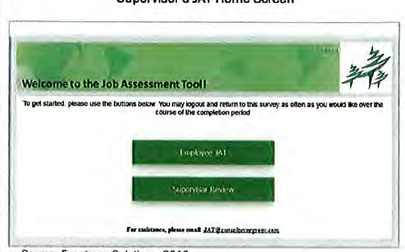
Exhibit 3-1 Supervisor's JAT Home Screen

Exhibit 3-1 below depicts a screenshot of the JAT home screen showing the levels of access for a supervisor. All supervisors have access to their own surveys in addition to the ability to review and approve the surveys of their direct reports. The supervisor review process ensures validation of the JAT data collected from employees and prevents comments made by employees from being taken out of context.